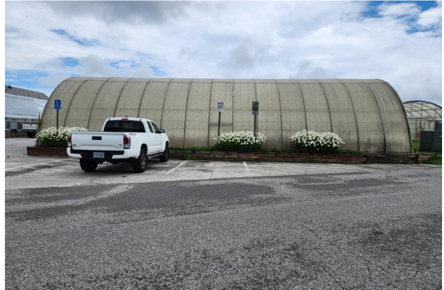
VIEW TO THE EAST