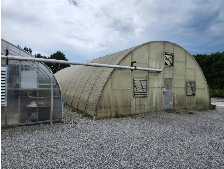
VIEW TO THE SOUTHWEST